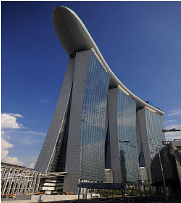
The outline of Marina Bay Sands

We are greatly proud that Pangu Decorative wall panel been selected to decorate one of the hallway which cover the area around 12000 square meter. The pattern was specified by Singapore Government that design from Pangu.